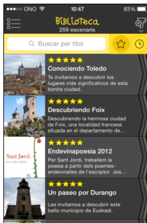
Some examples of Scenarios on a mobile device

A Scenario is an educational experience that takes place in a specific area. It contains objects with their geographical coordinates with the purpose of working on a topic or concept using a mobile device with a GPS.